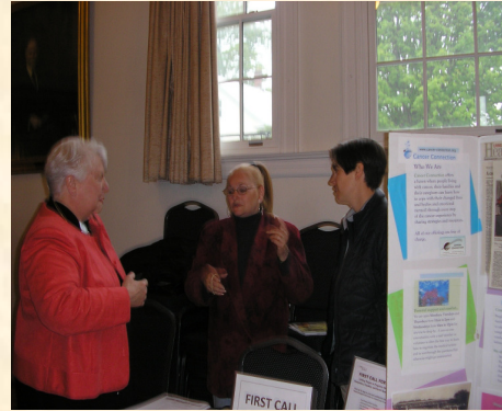
The Care Fair was held on May 12th at the Cummington Community House.

SERVICES INCLUDE: brown bag, foot care, blood pressure screenings, assistive equipment loans, hearing screenings, health fair, SHINE, tax preparation assistance, transportation, information and referral services, recreational activities, speakers, classes, workshops, meals, assistance with completing applications for some programs, housing information, outreach, emergency cell phones, and more. Call us for at 268-8407 more information.